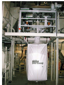
Big-Bag filling at the Degernau plant